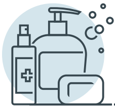
personal care kits

Get FREE support during isolation for COVID-19!