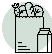
fresh food orders delivered to you