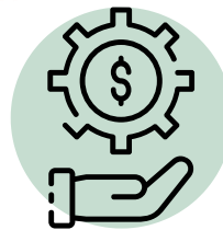
financial assistance for paying bills*